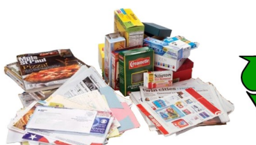
Mixed Paper Cereal, Pop, Food, Beer Boxes

The City of Virginia encourages you to take advantage of our regularly scheduled recycling pick up. Recycling saves you money by reducing the amount you pay for trash disposal. By recycling more at your curb, you will also help the City of Virginia earn a larger rebate from St. Louis County. Find out your zone and recycle at your curb!