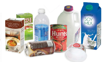
Containers - Plastic & Cans