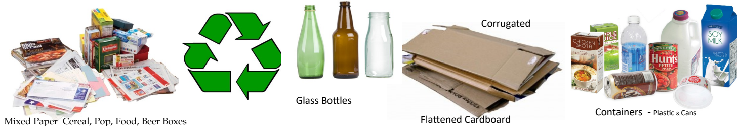
Mixed Paper Cereal, Pop, Food, Beer Boxes

The City of Virginia encourages you to take advantage of our regularly scheduled recycling pick up. Recycling saves you money by reducing the amount you pay for trash disposal. By recycling more at your curb, you will also help the City of Virginia earn a larger rebate from St. Louis County. Find out your zone and recycle at your curb!